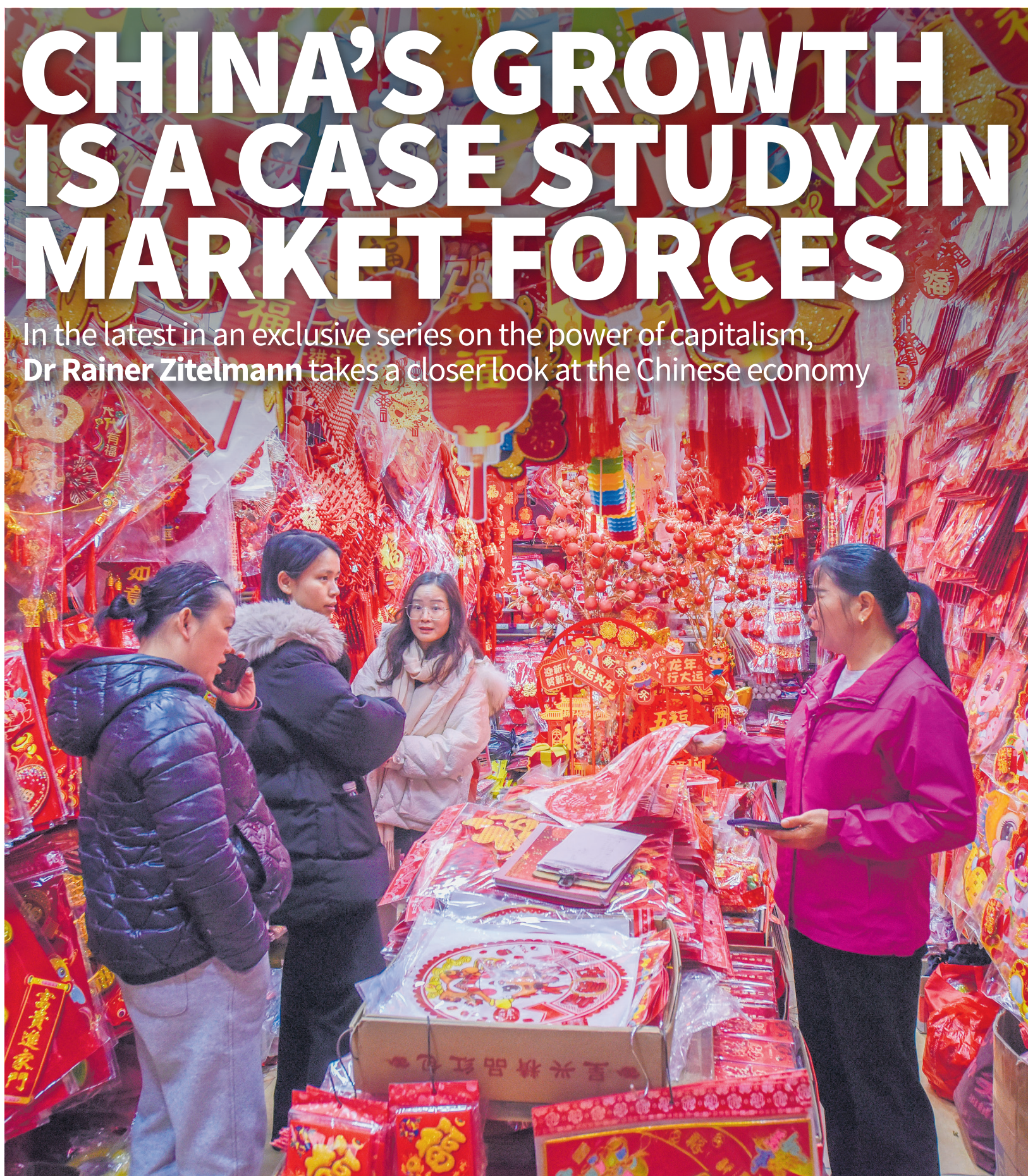
Customers choose ornaments for the Chinese New Year of the Dragon in Nanning, South China's Guangxi Zhuang Autonomous region